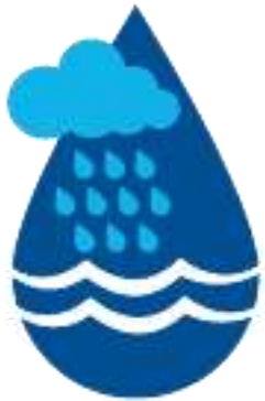
Water from Local Catchment