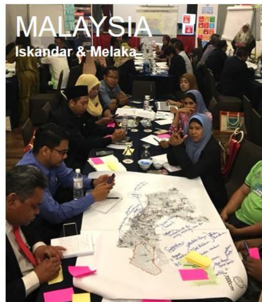
MALAYSIA Iskandar & Melaka