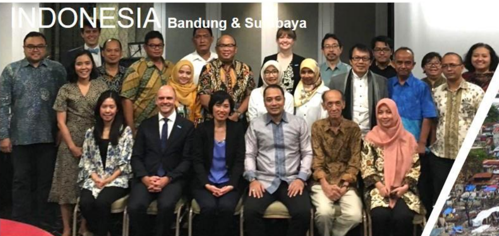
INDONESIA Bandung & Surabaya