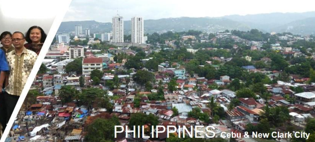
PHILIPPINES Cebu & New Clark City