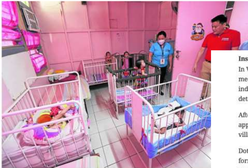
EASING INTO THE JOB | Social Welfare Secretary Rex Gatchalian on Tuesday, Feb. 7, 2023, visits the Study Center for Children in Bago Bantay, Quezon City, a shelter run by his agency for abandoned and neglected infants and children.