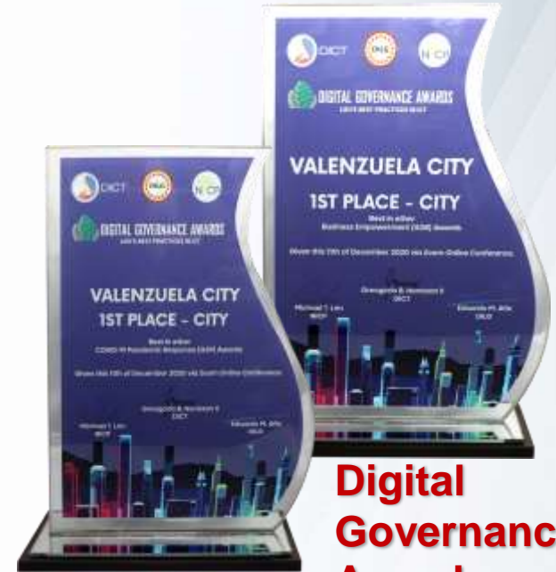
Digital Governance Award

Valenzuela City is among the pioneers in digitalization and innovative use of new technologies in governance.